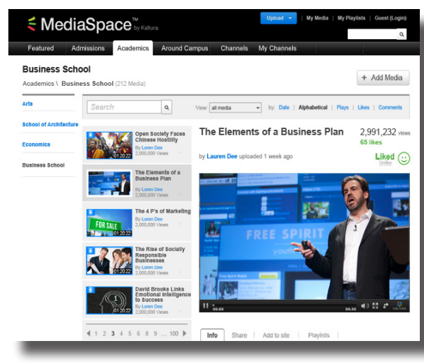
MediaSpace™ by Kaltura makes it easy to find and share Vidyo recordings

Based on moderation and access control rules set by administrators, end users can now retain full control of their recordings, share links to recordings, and search through the archive. In addition, content managed by Kaltura can be streamed to broad global audiences connecting through fixed endpoints and mobile devices, including iOS, Android, Blackberry, set-top boxes, and tablets, under a variety of network conditions.